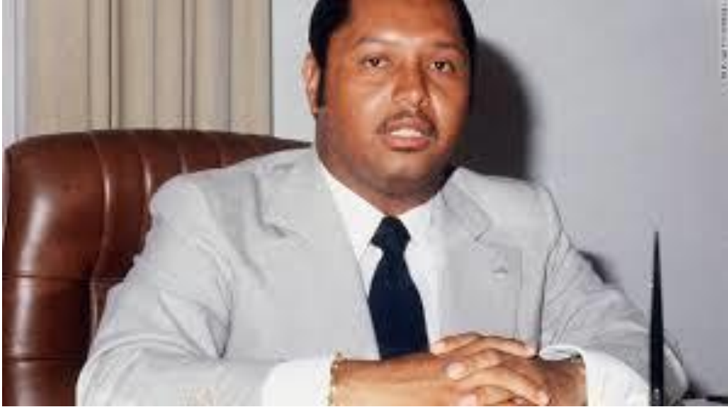
JEAN CLAUDE "BABY DOC" DUVALIER

Li deklere tet pa'l Prezidan le li te gen diz nef an apre papa'l mouri