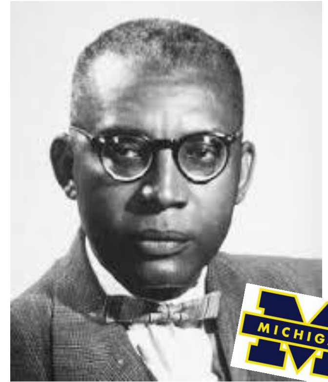
FRANCOIS "PAPA DOC" DUVALIER